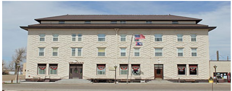
THE HISTORIC VIRGINIAN HOTEL, MEDICINE BOW